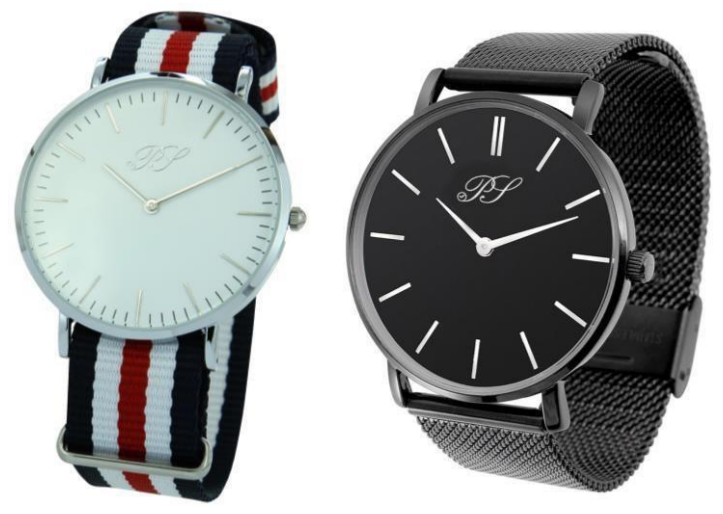
A9379SH.63470 | A9382BH.0250